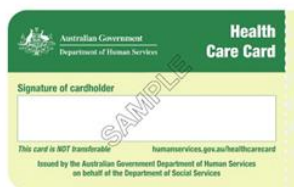
Centrelink Health Care Card