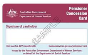
Centrelink Pensioner Concession Card