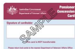
Veterans' Affairs Pensioner Concession Card